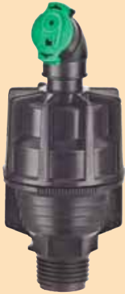
Non regulated (black base)