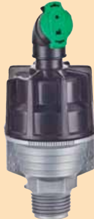
Regulated (silver base)

Applications: field crops, greenhouses, residential and landscaping For extra-range spacing up to 12 m